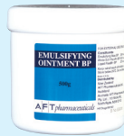
Emulsifying Ointment BP (AFT) – 500g