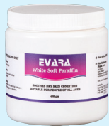
White Soft Paraffin BP* White Petroleum Jelly BP (Evara) – 450g, 2.5kg