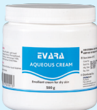
Aqueous Cream (Evara) – 500g