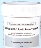
Paraffin BP Ointment 50/50 White Soft Paraffin 50%, Liquid Paraffin 50% (AFT) – 100g, 500g