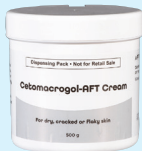
Non-Ionic Cream Cetomacrogol (AFT) – 500g