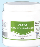
Fatty Emulsion Cream Cetostearyl alcohol, Paraffin liquid, Paraffin Soft White (Evara) – 500g